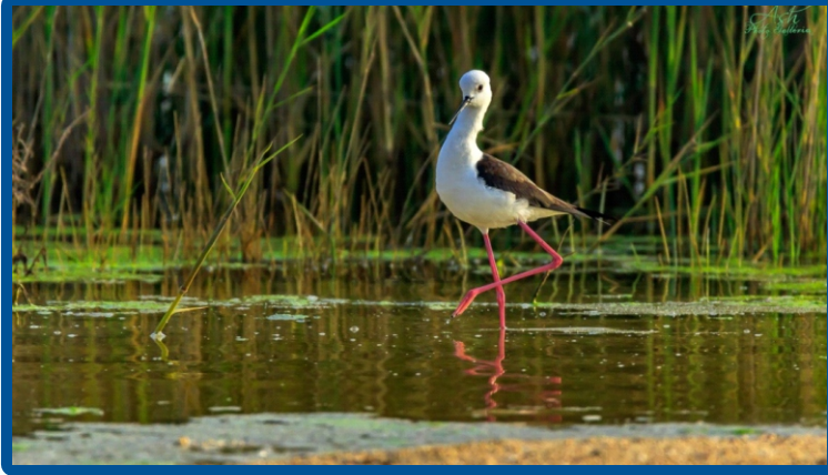
Bonal Bird Sanctuary, Shahapur