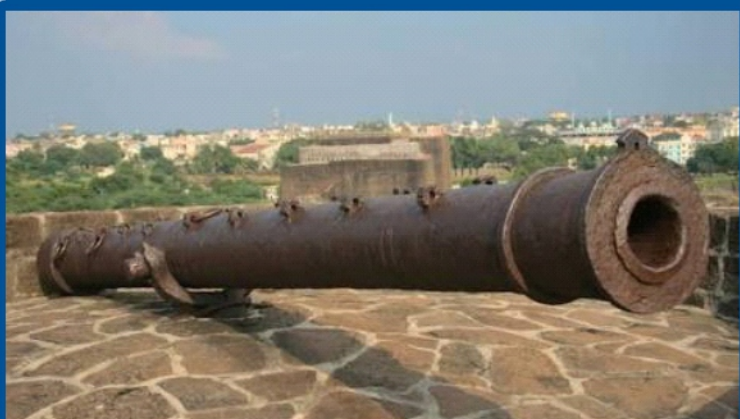
Cannon in Gulbarga Fort