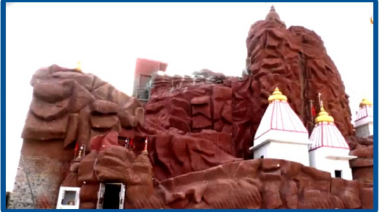
Vaishno Devi Temple